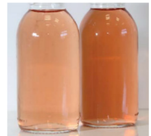
Figure 1: on the left, wine made with oxygen protection during pre-fermentation steps. On the right: wine oxidized during pre-fermentation steps.